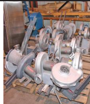
American Fan Blowers 220 volt 3 phase $125.00 each