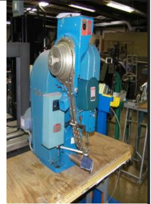
Stimpson Double Eyelet M# SAF-2 $950.00