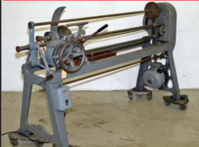
Utica Cloth Slitter