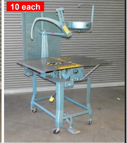
Pak-Tyer Model F-12 Bundle Tyer $750.00 each