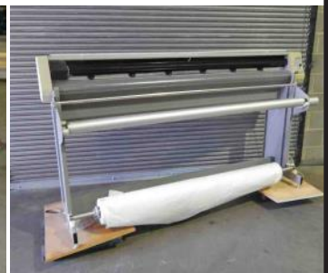
IOLine Model M28