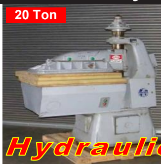
Schwabe Model DS 32" x 20", 220volt, 3 phase $4,500.00