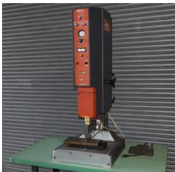
Reece/Branson 8400 Ultrasonic Sealer $1,995.00