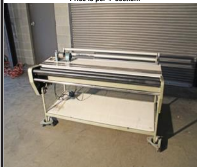
Flat Measuregraph Rewind Model 1-774-2, 60" Width $3,500.00