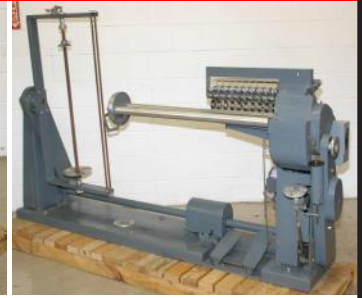
Utica Collarette Cutter

Tubular Fabric Cutting machine for cutting binding