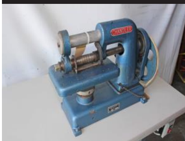
Chandler Pinking Machine Model EHD, 3-1/4" Roller $975.00