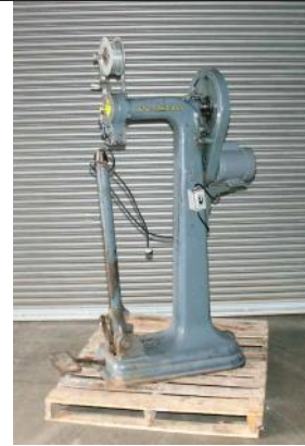
SilverStitcher Box Stapling Machine Sold As Is $350.00