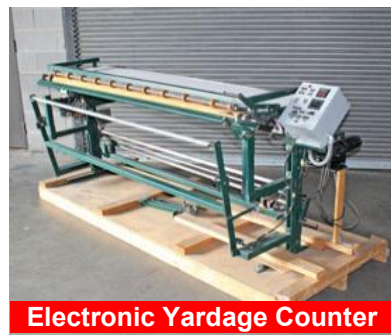
Electronic Yardage Counter