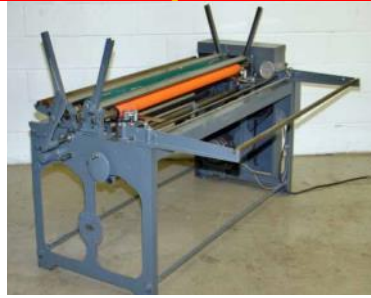
Utica Side Slitter

36" Fabric Width Slit & Rewind Tubular Fabric