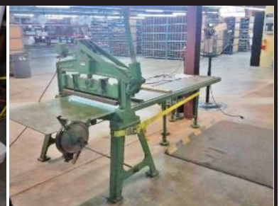
Swatch Cutter 32" Blade, 6' x 3' Work Area $850.00

Visit Us Online at WWW.T-TLIQUIDATORS.COM