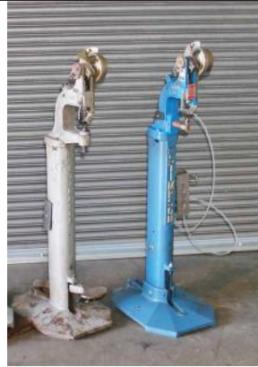
Stimpson Grommet and Snap Press Machines $450.00