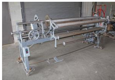
Utica Fabric Roll Slitter

104" Overall, 2" Shaft Diameter 15" Blade, 75" Rewinder