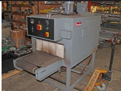
Shanklin Shrink Tunnel 6' Length, 14" Wide Belt $1,550.00