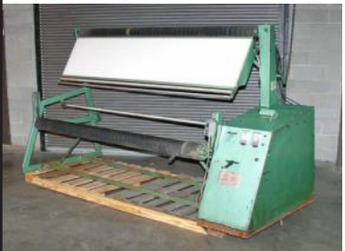
Sunco Inspection Machine