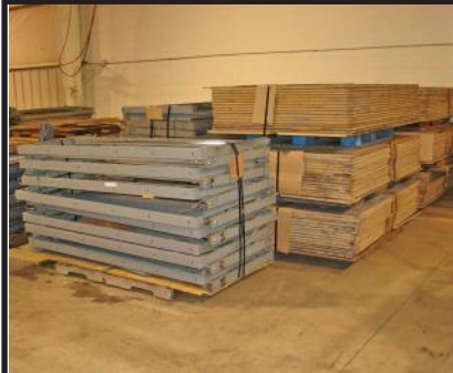
New Phillocraft Cutting Table Call for Sizes and Availability $275.00 to $350.00 Price is per 4' section!