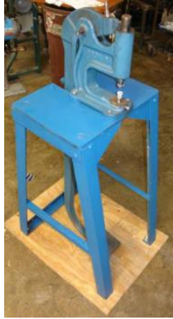
Manual Kick Press Several Available $450.00 each