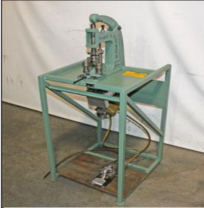
Handy Button Pneumatic Cover Press $995.00