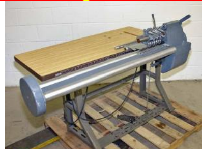
Utica Collarette Cutter

Table Top Fabric Cutting machine for cutting binding