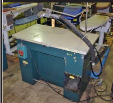
Trimmer Thread Trimmer 2 each Available $450.00 each