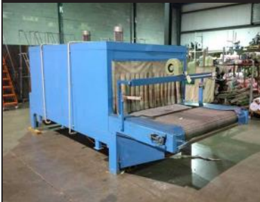
Heat Shrink Tunnel 15' Length, 60" x 24" Opening $4,950.00