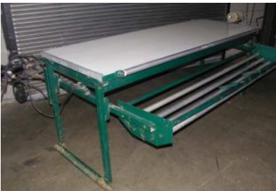
Flat Table Top