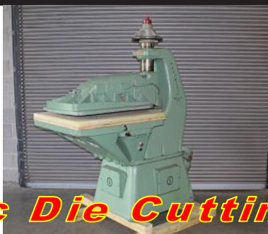
Schwabe Die Clicker Model DS, 30" x 24" Head Reduced $2,455.00