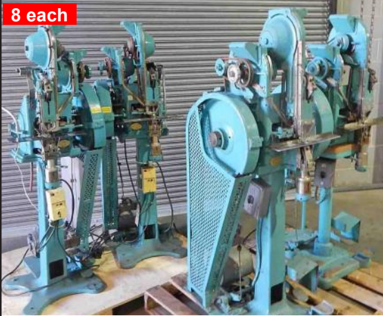
Scovi Snap Press Model 41BL & 68BL, Full Automatic Feed $1,495.00