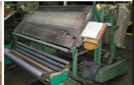
Cloth Inspection Machine