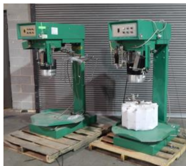
Senfix Model 75A 1 complete/1 parts $595.00 both