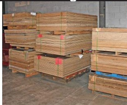
Used Phillocraft Cutting Table 78" and 90" Air Flotation Available $200.00 to $250.00 per 4' section